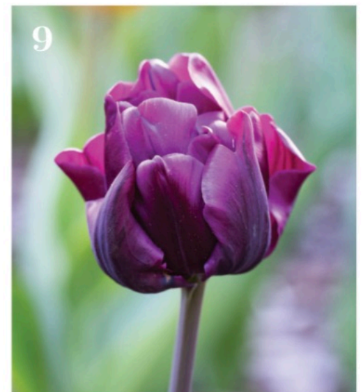
1. 'Dreamer' tulip 2. 'Valdivia' tulip 3. 'Orange Balloon' tulip 4. 'Escape' tulip 5. 'World Friendship' tulip 6. 'Geranium' narcissus 7. 'Continental' tulip 8. Eastern redbud 9. 'Negrita' tulip