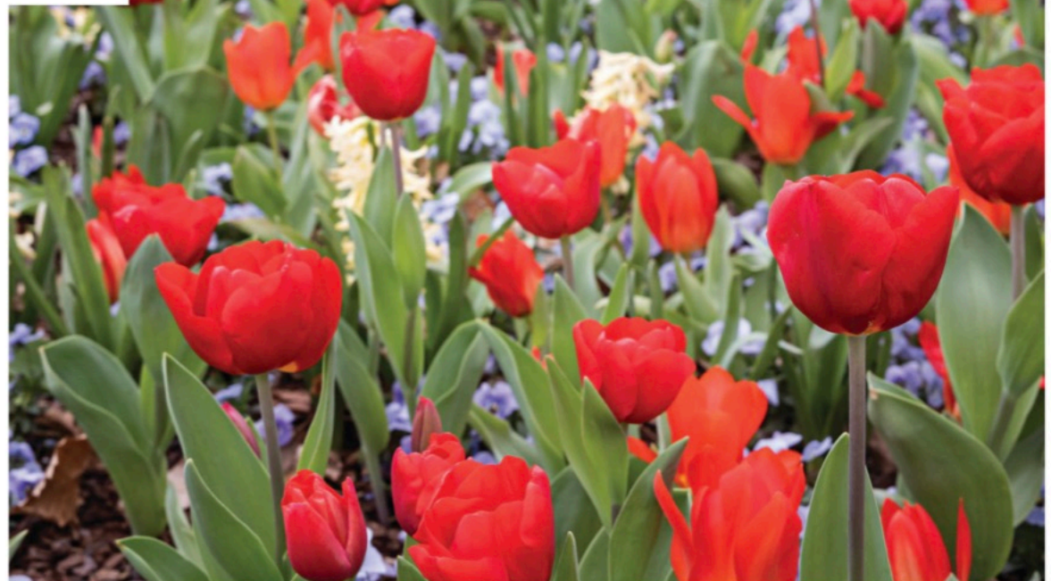
STARS OF THE SHOW The Bradford Robertson Color Garden holds an abundance of tulips.