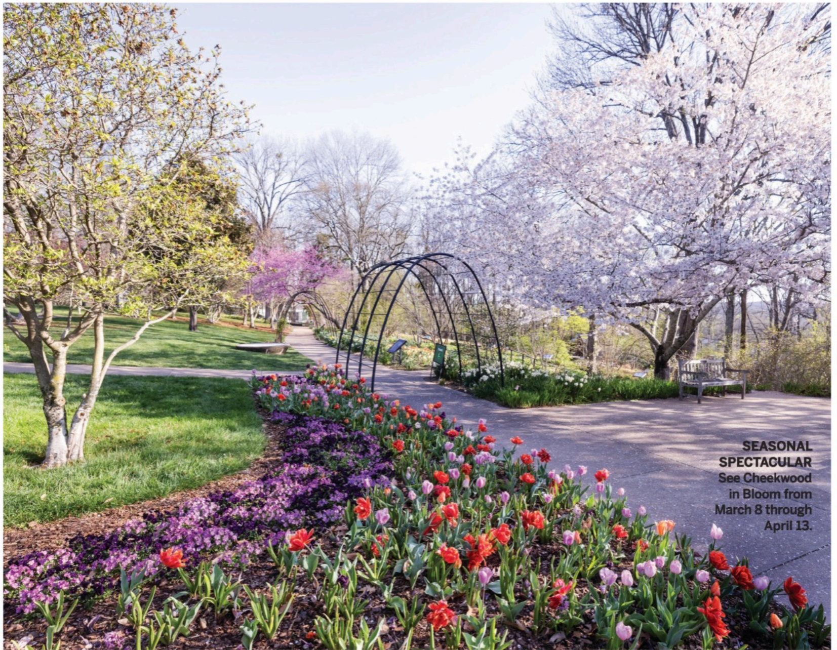
SEASONAL SPECTACULAR See Cheekwood in Bloom from March 8 through April 13.